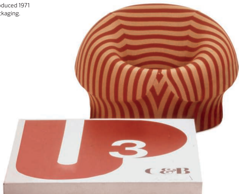
An example of an inflated UP3 chair.